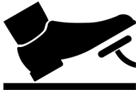
Step on the brake pedal

Review with customer before administering the driving test: