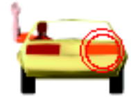
Right turn arm signal